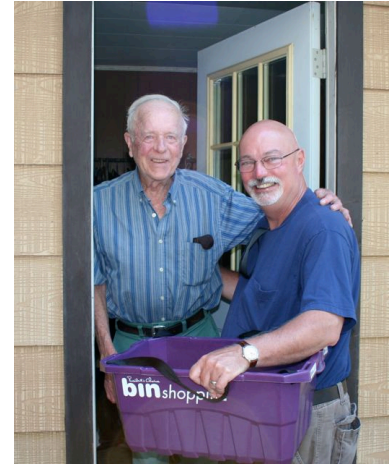
Here is a happy Meals on Wheels recipient receiving his meal!